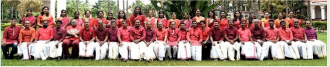
Alumni of MBBS (Batch 1994-1999) celebrated their reunion from 2 nd to 4 th August in Bengaluru.