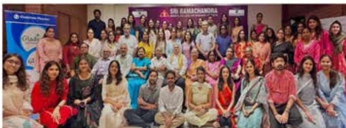
Dept. of Dermatology on 23 rd July. 60 alumni attended.