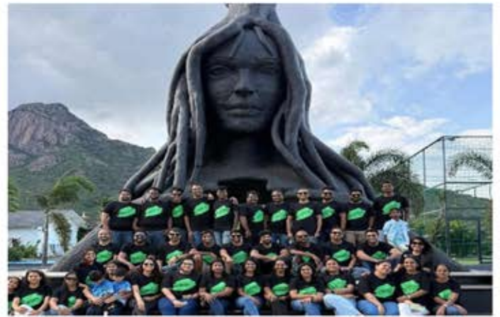
SRIHER MBBS Batch of 2005-2010 celebrated their alumni reunion from 4 th to 6 th July at Darza Resorts, Coimbatore. 35 alumni attended.

The following Depts. of SRMC&RI celebrated their Silver Jubilee with alumni reunions: