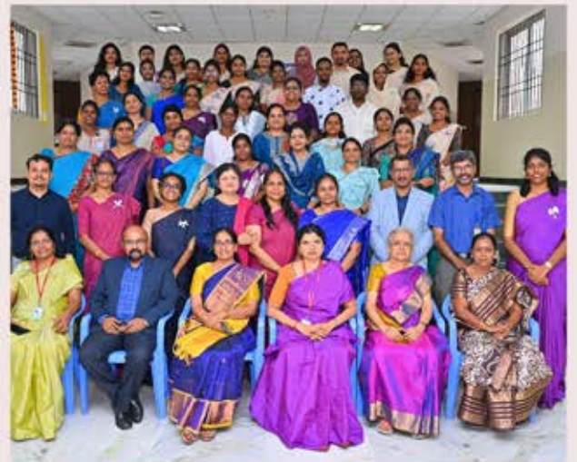
Dept. of Physiology, on 23 rd July. 55 alumni attended.