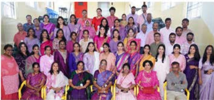
Dept. of Microbiology on 12 th July. 99 alumni attended.

The following Depts. of SRMC&RI celebrated their Silver Jubilee with alumni reunions: