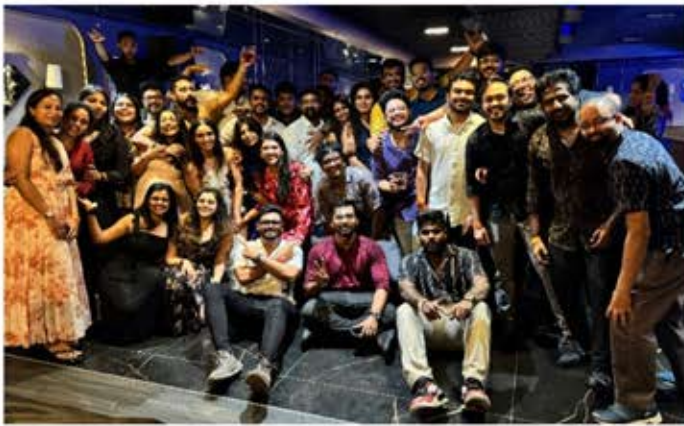
SRIHER MBBS Batch of 2015-2020 celebrated their alumni reunion on 19 th July. 40 alumni attended.